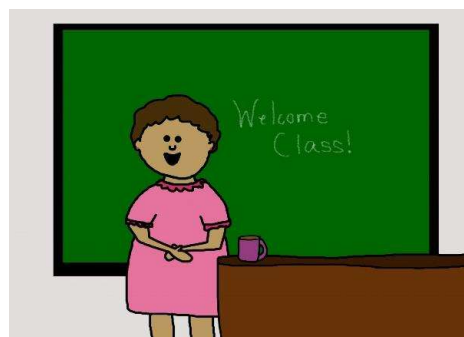
Your child's class teacher

Writing targets on an Individual Provision Map (IPM), based on their progress, identified needs and sharing and reviewing these with parents.